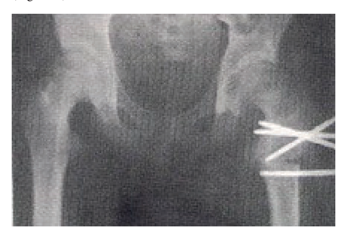
Figure 2. Postoperative radiograph of epiphysis capitis femoris after Southwick corrective osteotomy and stabilisation with external fixator type M20

A Southwick corrective osteotomy was performed two months after the conservative treatment of chronic EFH (Figure 2).